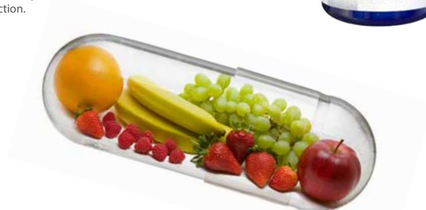
The picture is an illustration