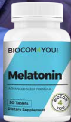
Melatonin 3mg 50 Tablets

... that it happened only in 1958 that the mysterious compound produced by the pineal gland was isolated? It was named Melatonin. (The Greek word melas means black, referring to the fact that this hormone is produced exclusively in the dark and to the effect of darkness in living organisms.) The melatonin level shows significant diurnal fluctuations, it is ten times higher at night than during the day in humans, and plays an important role in the regulation of sleep-wake cycle.